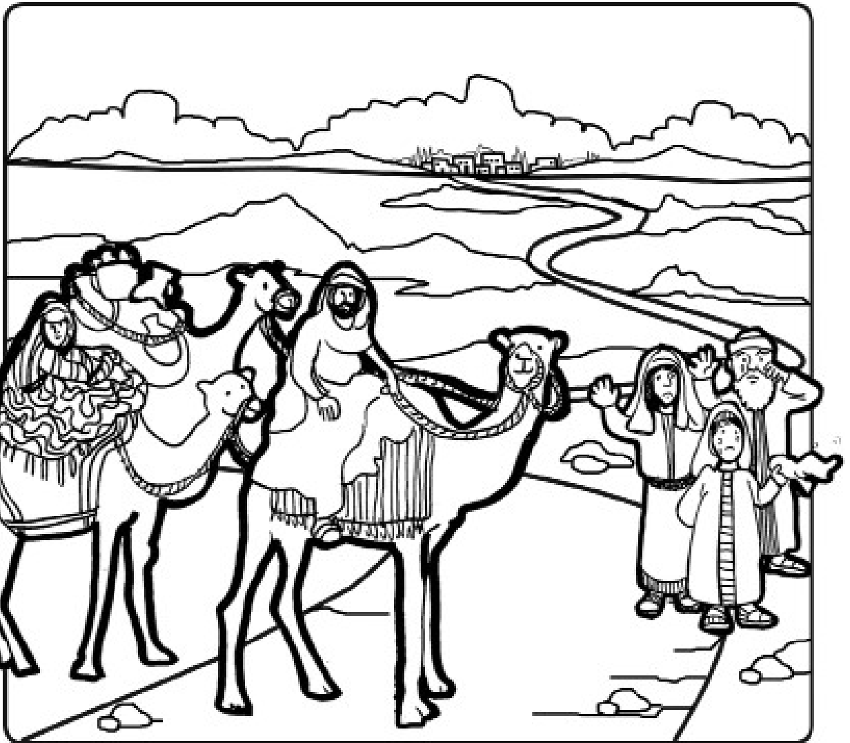
Rebekah's journey was a long one! Trace her journey from one land to another one.