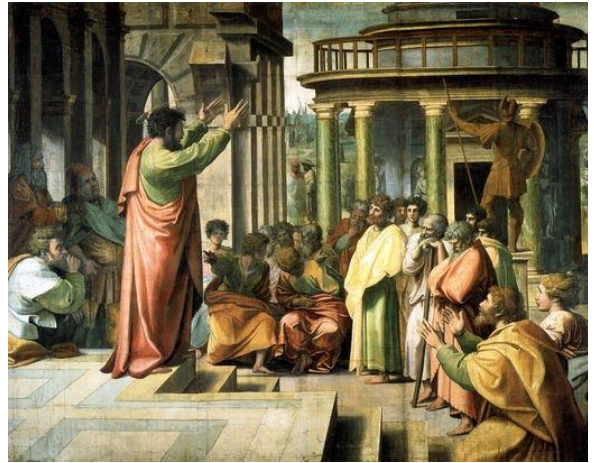
Peter at the Council of Jerusalem

Blessings to you all for St Peter's Day.