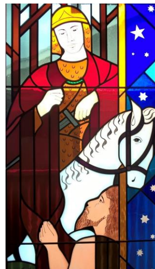
St Martin sharing his cloak with a beggar (window at St Martin's, Glenelg South)

Then the righteous will answer him and say, 'Lord, when did we see you hungry and feed you, or thirsty and give you drink? When did we see you a stranger and welcome you, or naked and clothe you? When did we see you ill or in prison, and visit you?' And the king will say to them in reply, 'Truly, I say to you, whatever you did for one of the least of these my brothers or sisters, you did for me.'"