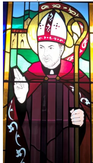
(window at St Martin's Glenelg South)