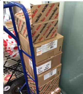
94 Graduation bibles were donated as gifts for Year 6 & 7 students at SPW