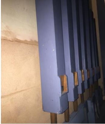
The salt damp was fixed and the organ pipes reinstated at St Peter's.