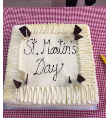
St Martin's Day was a quieter affair but the cake was delicious