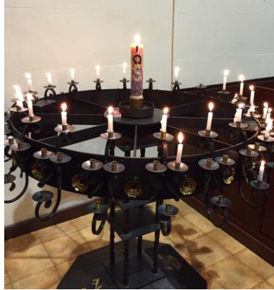
A beautiful and prayerful service was held for All Souls Day