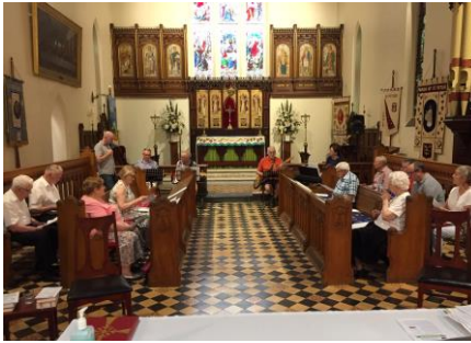
We paused singing for a while then came back physically distanced in good voice