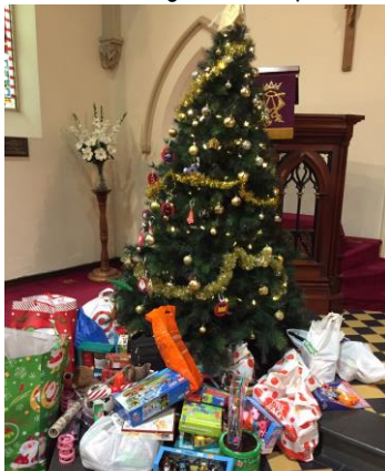
A wonderful collection of toys and food for Anglicare Hampers