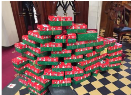
55 Shoeboxes of love were sent off with all the costs covered by a generous donation.